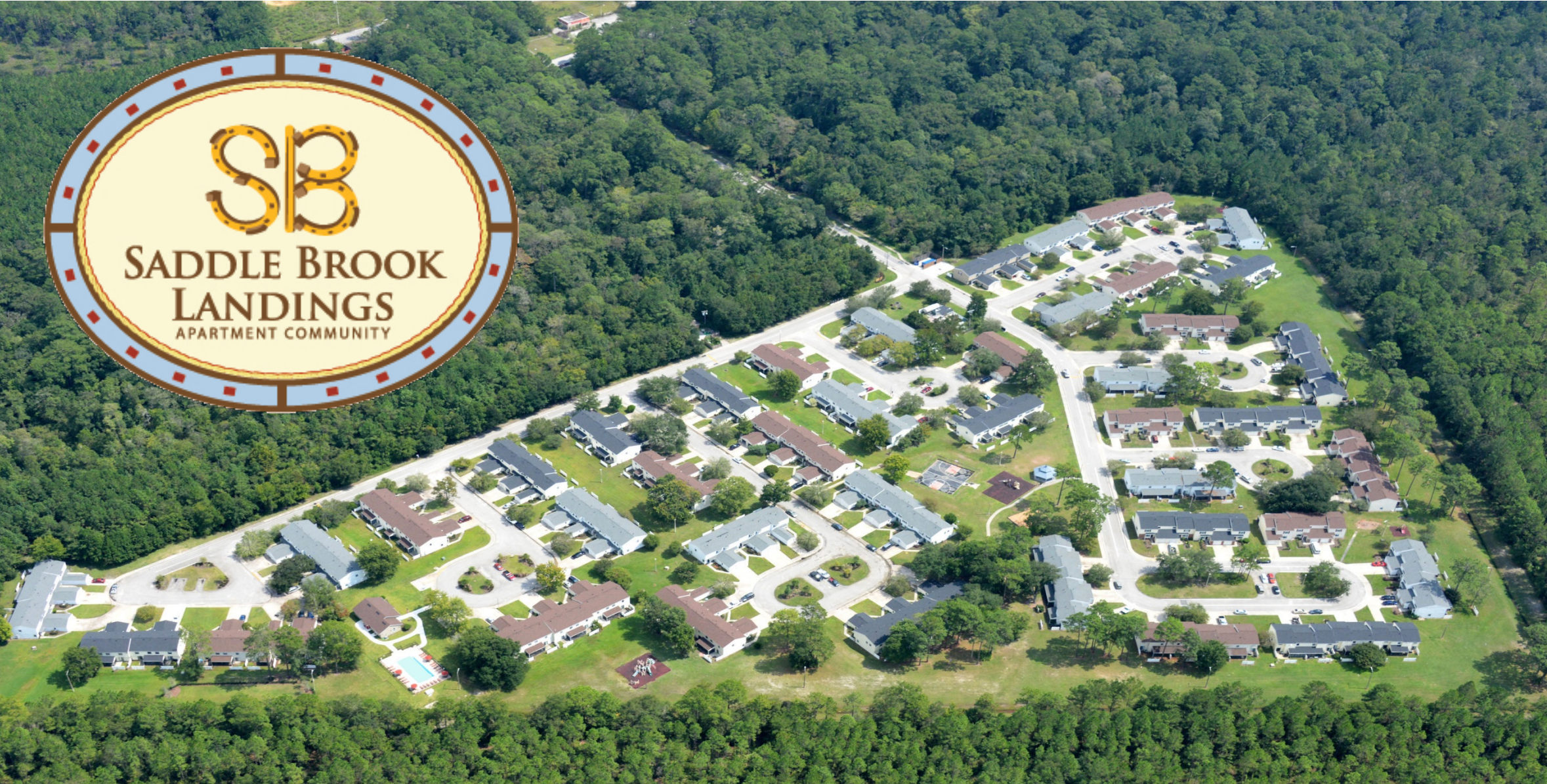
Aerial view of Saddle Brook Landings Today